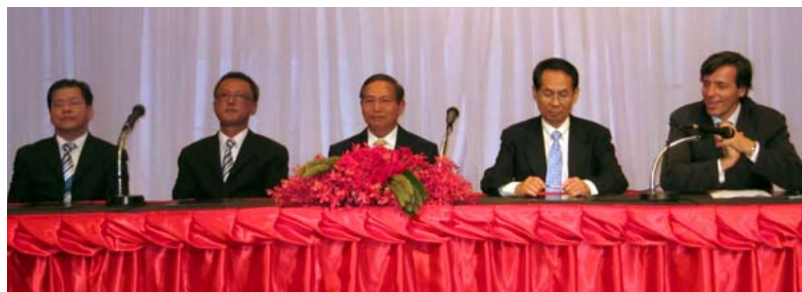
Signing ceremony for THB 826,500,000 project financing between Krung Thai Bank and Chiang Rai Solar Company Limited on 20 June 2011.